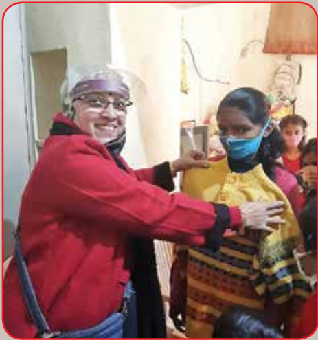
Sweaters distributed to children at Short Stay home