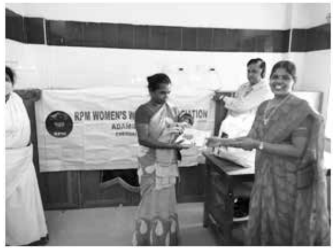
New mothers were presented kits