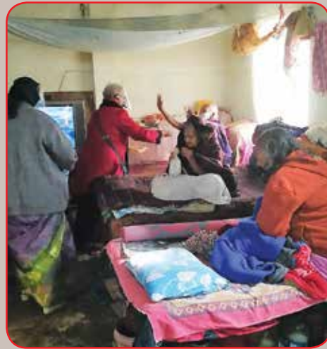
Matajis at Tarash Mandir Old Age Home being given gajak