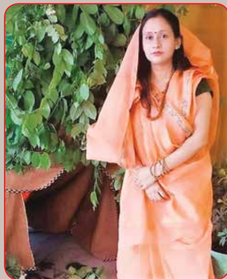
Ram Lila celebration at Sanjeevni Mahila Sanstha, Meerut