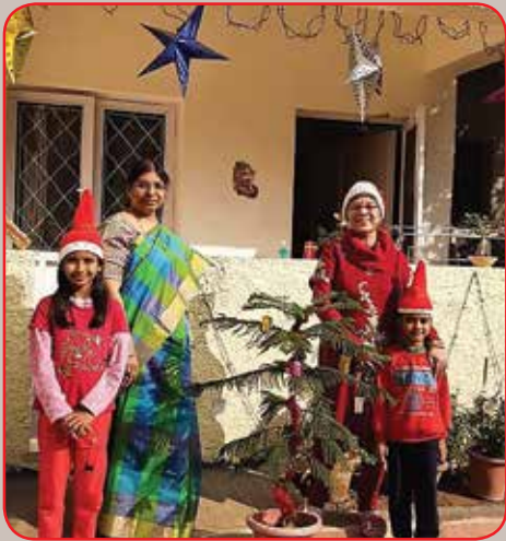
Christmas at Head Office