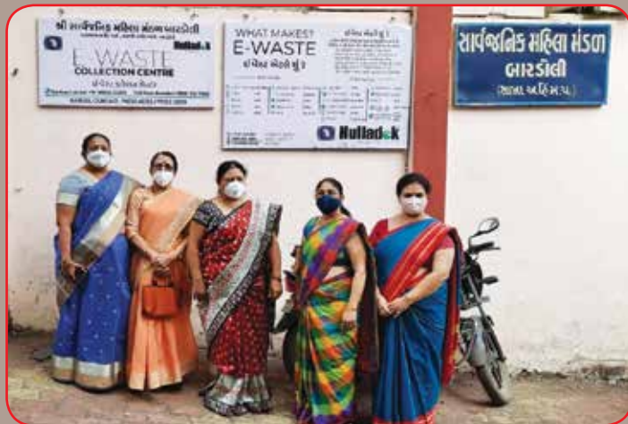
Shree Sarvajani Mahila Mandal, Bardoli inaugurated an e-waste collection centre with Hulladex Pvt Ltd.